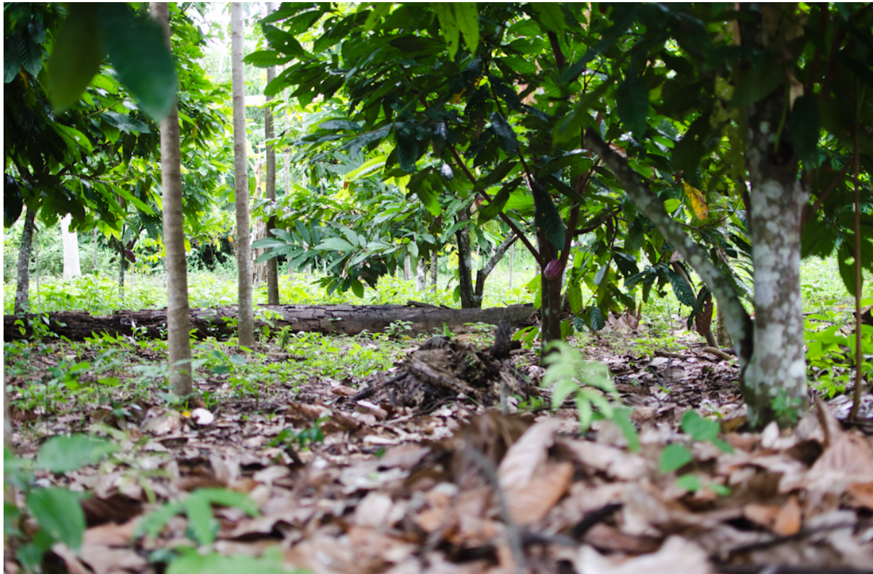
Above: Cacao bushes inter-planted with palo roman for shade and shelter from wind

Before joining the project in 2008 Patrocinio was growing bananas, coffee and cacao. Although coffee and cacao are regarded as high value crops, they are also extremely hard work, particularly in this harsh climate. The lowland varieties grown here are of much lower quality than those of hilly regions like the Yungas. Farmers here have also struggled to reproduce the same quality of cacao beans as those in the wild. Yields are also relatively low and are increasingly affected by a cool seasonal wind called the Surazo, which is becoming more and more unpredictable.